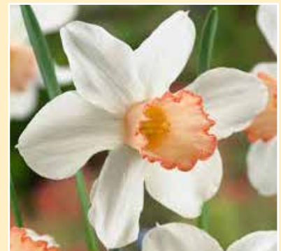
N. ‘Mrs. R. O. Backhouse’