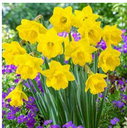
Narcissus obvallaris , commonly called The Tenby Daffodil

to colonial American gardens. Thomas Jefferson's first entry in the garden book, a diary he kept for almost 60 years, begins on March 30, 1766: "Purple hyacinth begins to bloom." The following week he wrote: "Narcissus and Puckoon open." According to the official website of Jefferson's Monticello, our third President's "Calendar of the bloom of flowers in 1782" focuses on bulbs, noting their overlapping and ephemeral sequence of flowering beginning in March and running through May of narcissus, jonquils, hyacinths, anemones, ranunculus and tulips.