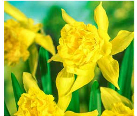
N. ‘Telamonius Plenus’ / N. ‘Van Sion.’