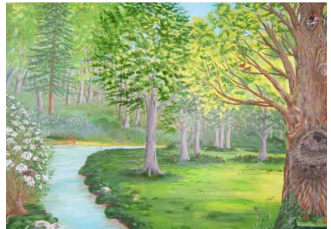
Below: Book drop is disguised beneath squirrels’ nest.