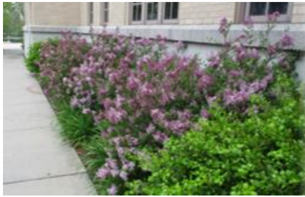
Cragin Memorial Library – CGC donated Korean Lilacs

The only participation requirement is to pay annual membership dues; members participate in meetings, community service and other club offerings to the extent of their interest and time. Membership dues are $25.00 for individuals and $40.00 for couples. Dues are prorated the first year based on the calendar quarter new members join.