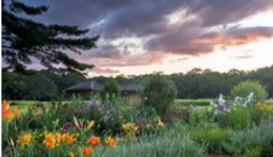
Cohen Woodlands Butterfly Pollinator Garden

Joining a local garden club is a great way to expand your gardening interests and skills. It's an opportunity to build new friendships while contributing to improving the community and environment.