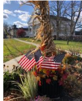
Xeriscape Garden and town planter in center of Colchester for Veterans Day

During COVID 19 pandemic, CDC guidelines being followed for safety, and meetings being held by ZOOM.