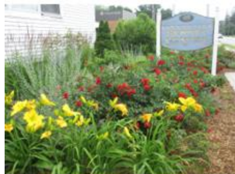
Colchester Senior Center gardens enhanced/ maintained by CGC volunteers.