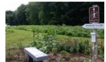
Children's Garden at StoryWalk