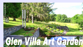
Glen Villa Art Garden

705 Bloomfield Ave, Bloomfield, CT 06002 860-243-1630 • 800-243-1630 www.friendshiptours.net