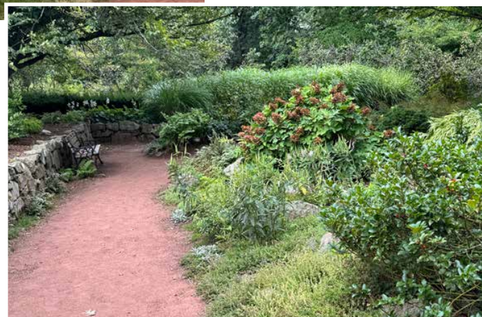
According to the park website, the Julian and Edith Eddy Rock Garden “is also known as the Shade Garden, it features mixed plantings of herbs, perennials, ornamental grasses, woody shrubs, and small evergreen and deciduous trees.”

Even some of the old species of roses in the Heritage Rose Garden may bloom in the fall, according to Gutzmer. Rose lovers will find this garden interesting, since some of the varieties of roses predate 1867. Some of the other plants, including alliums, dahlias, and calamint, will keep blooming in there as well.