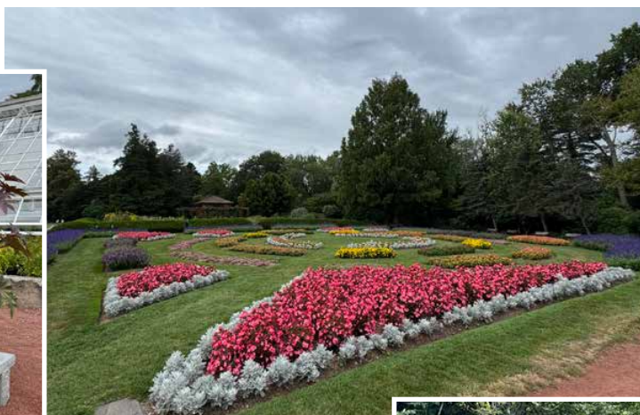
No two gardens are alike! The plants and flowers in the Robert A. Prill Annual Garden are changed up every year.

Plants such as the castor bean or castor oil plant, (from which the poison ricin is extracted, live and grow in the medicinal garden, and bloom with beautiful pink or red flowers.