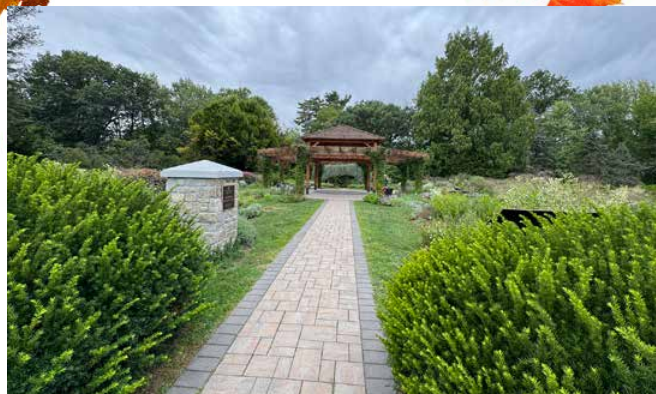
The Sue B. Hart Perennial Garden is designed to be a four-season garden. The trees that back it up turn spectacular colors in the fall.