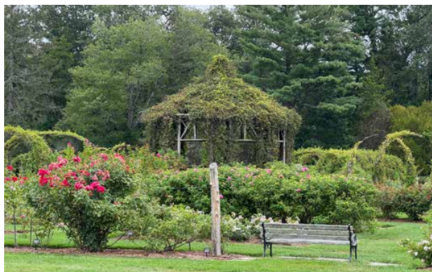
The Virginia Creeper will bloom on top of the rose garden's iconic gazebo this fall.